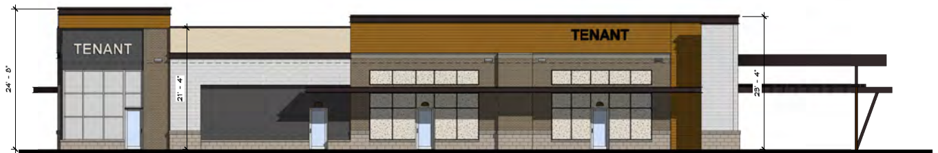
4 REAR ELEVATION 6A-4.1 SCALE 1/8" = 1'-0"