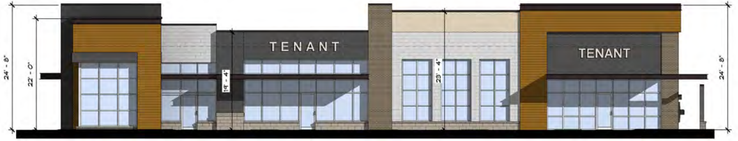
1 FRONT ELEVATION 4A-4.1 SCALE 1/8" = 1'-0"