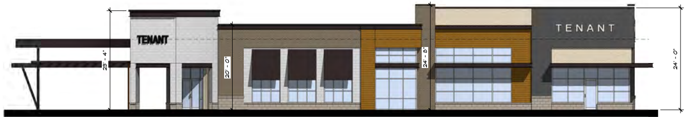
1 FRONT ELEVATION 6A-4.1 SCALE 1/8" = 1'-0"