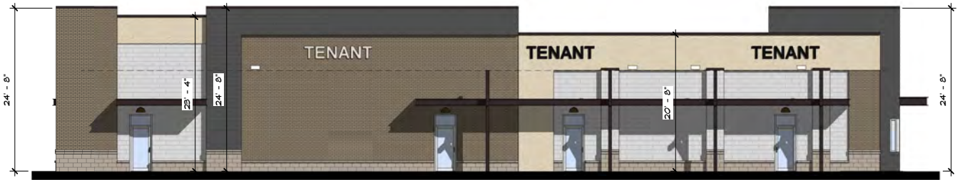
4 REAR ELEVATION 4A-4.1 SCALE 1/8" = 1'-0"